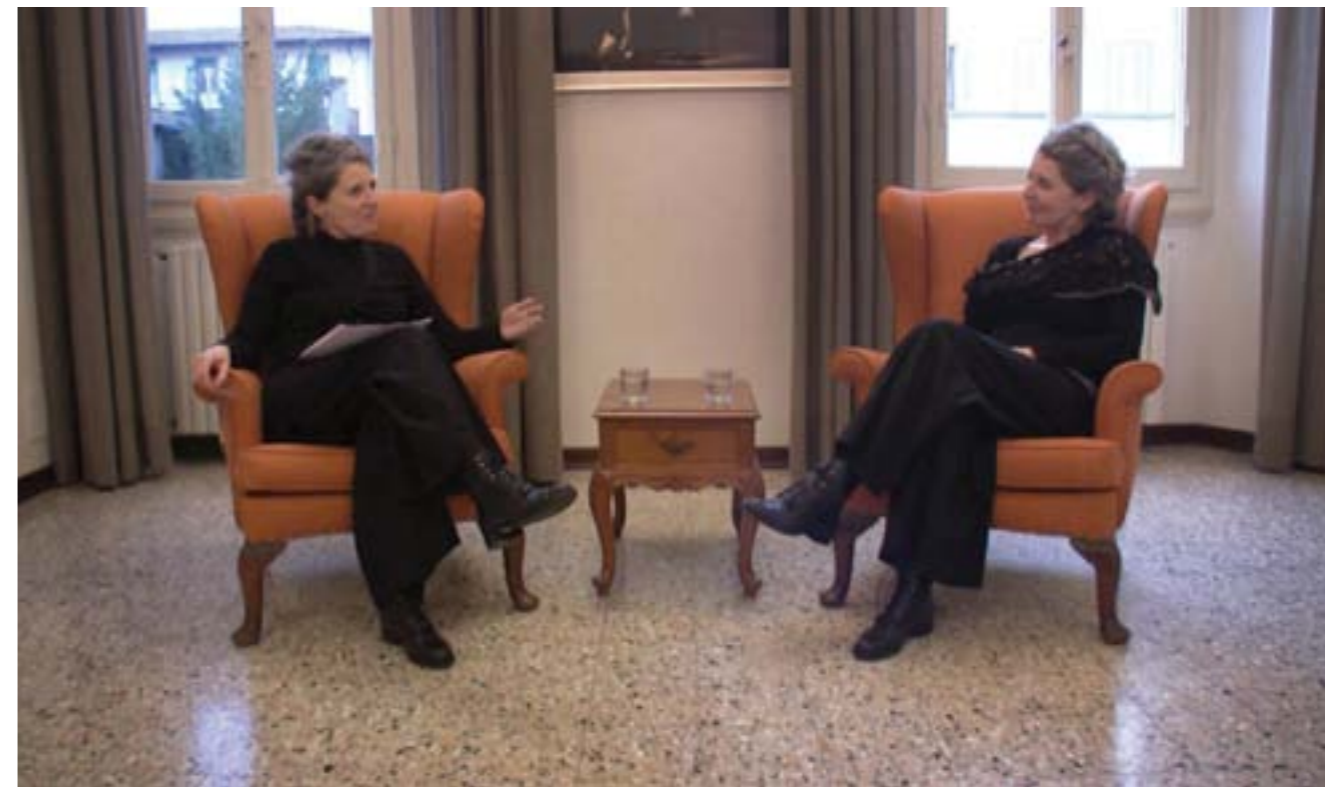
Elizabeth Woods / want to know what Art is, 2011 (detail)